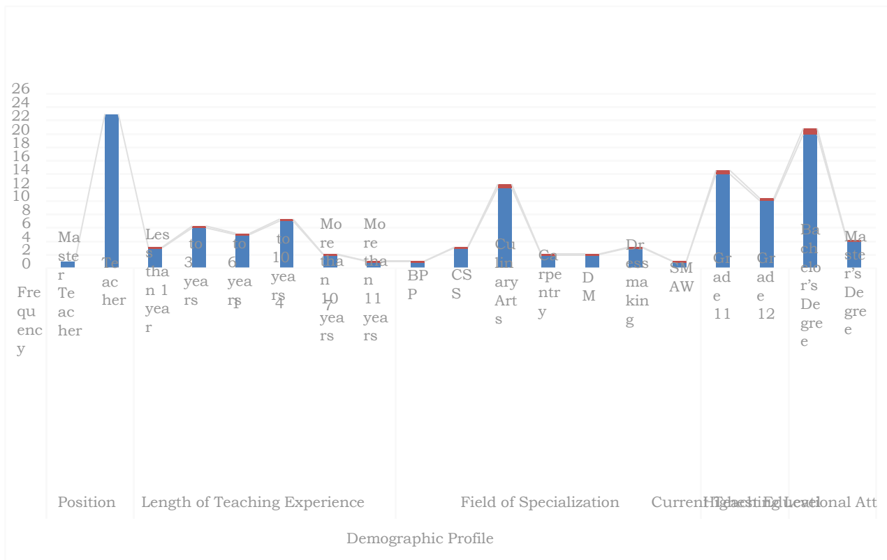
Figure 1. Demographic Profile Survey for TVL Teachers as to Position/role, Teaching Experiences, Field of Specialization, Current Teaching Level and Educational Attainment

The demographic profile analysis reveals insightful patterns about the distribution of teachers across various categories, including their positions, length of teaching experience, field of specialization, current teaching level, and highest educational attainment.