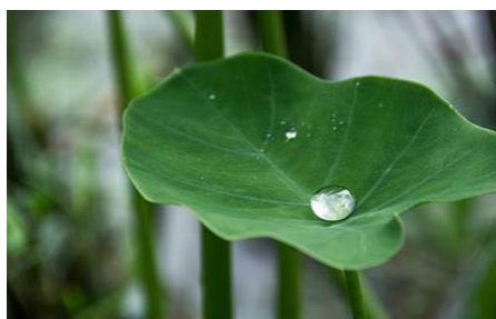
Figure 1. Taro Leaf

Colocasia esculenta , commonly known as taro, is a tropical plant grown primarily for its edible corms. Probably native to southeastern Asia, whence it spread to pacific islands, it became a staple crop, cultivated for its large, starchy, spherical underground tubers, which are consumed as cooked vegetables, made into puddings and breads. The large leaves are commonly stewed.