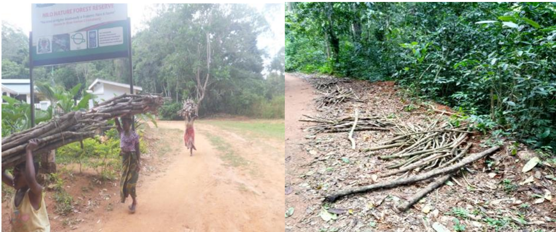
Fig 1. Firewood collection inside Nilo nature reserve.

Incidences of illegal logging, fuel wood collection, and pole cutting were also observed, however they were low due to intensive patrols and awareness among local people. Fuel wood collection inside the nature reserve was the main cause of disturbance. This is because local people adjacent the reserve use firewood as their major source energy for cooking and or warming. Another, disturbance to A. moreaui which was observed is the emerging challenge of increasing cover of the invasive tree species namely Maesopsis eminii which appears to replace natural vegetation including climbers and vines in natural forest gaps which are preferred by A. moreaui . M. eminii tends to change the forest from natural dynamic mosaics to uniform dense forest which is not preferred by A. moreaui .