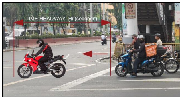
Figure 1.2 Parameters for Time Headway Method (cross-sectional view)

Figure 1.2 illustrates the idea of time headway using an actual road scene.