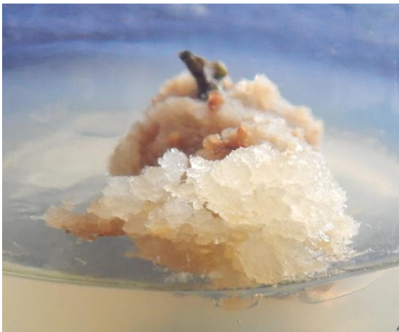
Fig. 3: Callus growth in 2,4-D at 4 mg/L