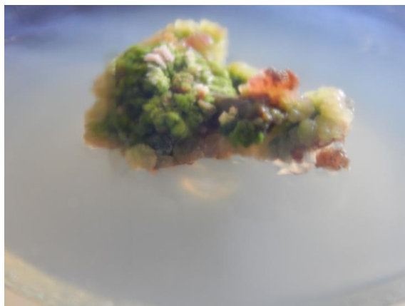
Fig. 5: BAP+IAA+Adenine sulphate(2mg/L+0.5mg/L+40mg/L)