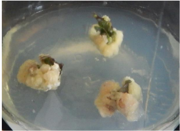
Fig. 2: Callus growth in 2,4-D at 3mg/L