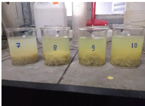
Figure 1: pH standardization for PAC