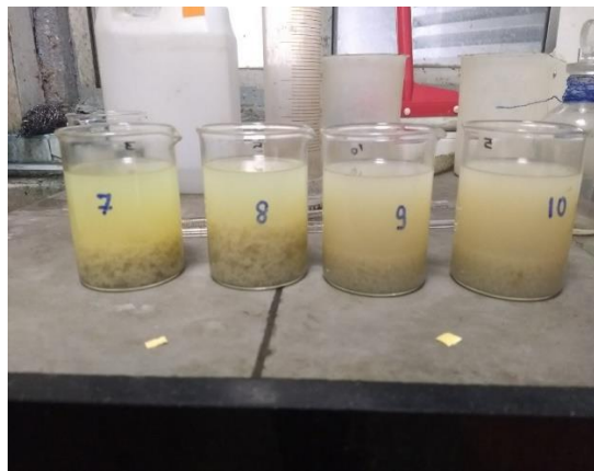
Figure 2: pH standardization for FeCl 3