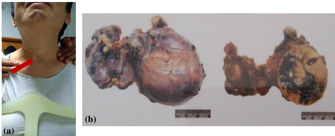
Fig.1. (a) Clinical condition of the patient wearing lumbar support to secure the spine. Arrow in picture exposes the thyroidectomy surgical mark; (b) Pathology anatomy result from previous thyroidectomy revealed an adenomatous goiter.