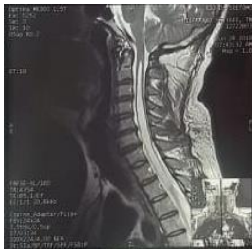
Figure 3. MRI imaging (T2-weighted sagittal) with contrast revealed syringomyelia cavity (hyperintense syrinx) from vertebral level C2 to Th5 with Type I Arnold-Chiari malformation.