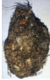
Fig 1. Rotted yam- source of inoculum

Four fresh healthy tubers of yam were washed with tap water and distilled water, respectively and thereafter sterilized with 70% ethanol. Cylindrical discs (3 mm) were removed from the tubers with a sterile cork borer. About 3 mm discs of 5 days old cultures of the isolate were used to plug the holes created in the tubers.